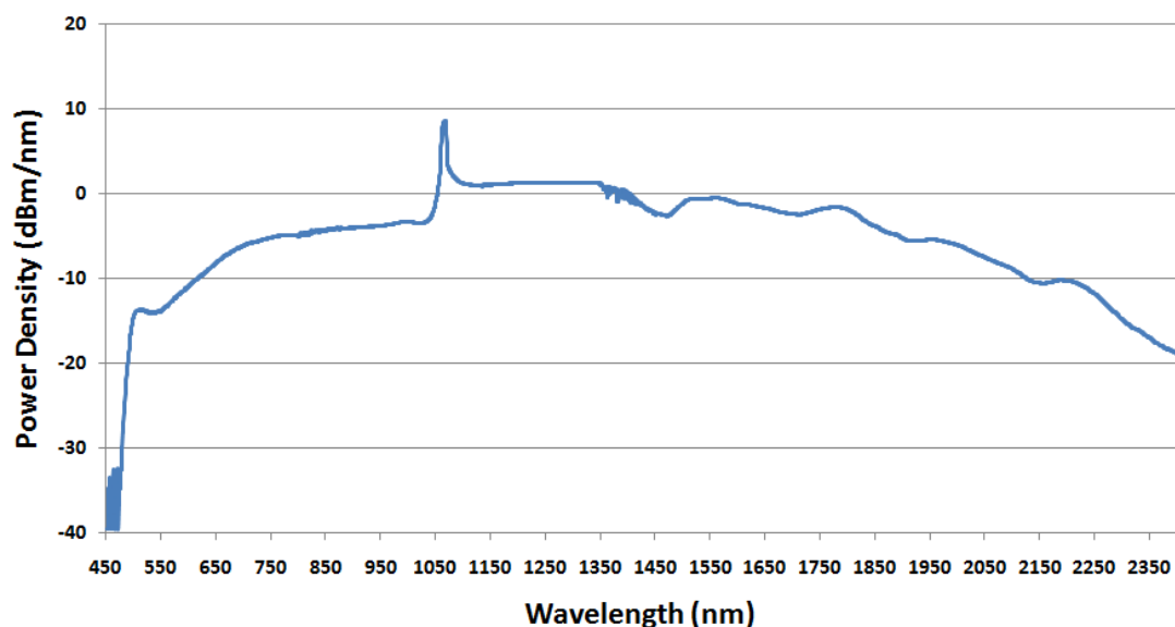
SC-5-FC Typical Spectrum